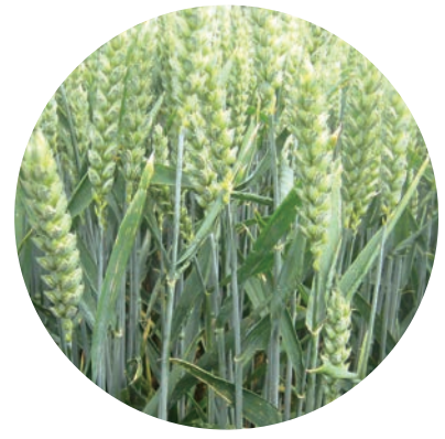
Fungicide + Velocity